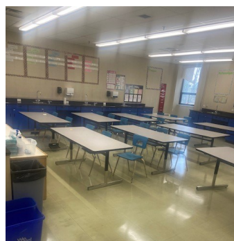
Look! a Science Lab for all our classes to use! Yeehaaaw!