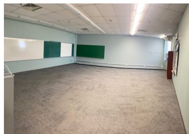
Newly cleaned classrooms, ready for move in!