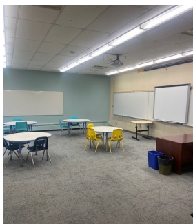
Breakout/Outdoor Education Room.