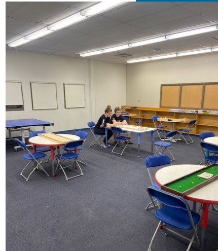
Student Lounge in Action!