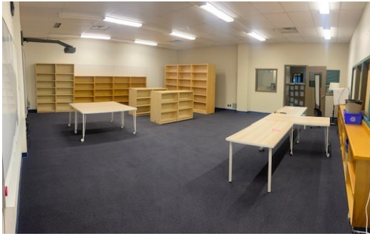
The Program Support room almost ready. Resources to be moved in soon!