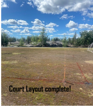
Court Layout complete!