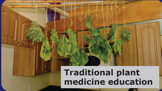
Traditional plant medicine education