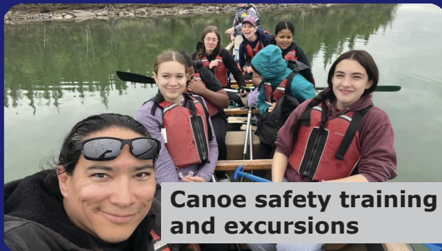
Canoe safety training and excursions