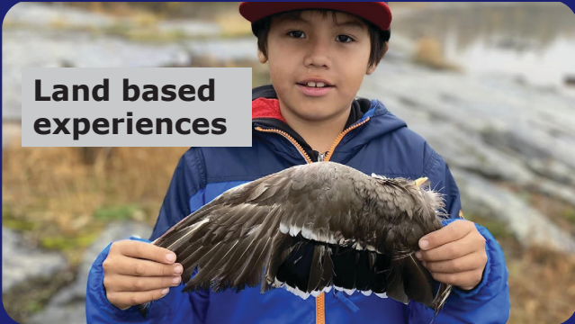
Land based experiences