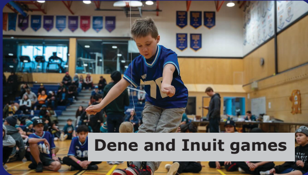
Dene and Inuit games