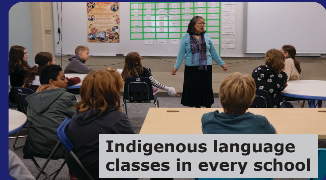
Indigenous language classes in every school