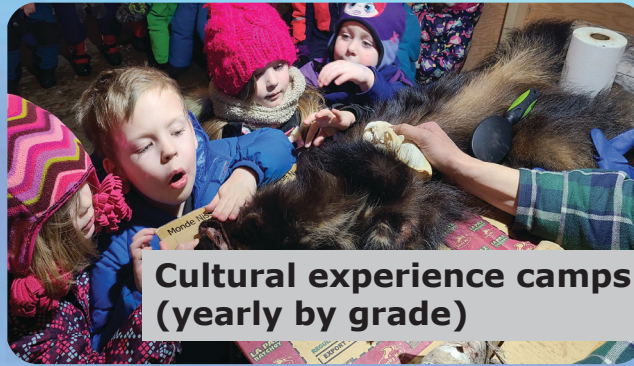
Cultural experience camps (yearly by grade)