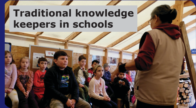
Traditional knowledge keepers in schools