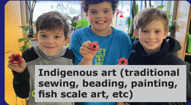
Indigenous art (traditional sewing, beading, painting, fish scale art, etc)