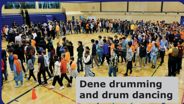
Dene drumming and drum dancing