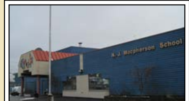
N.J. Macpherson School (JK-5) 525 Range Lake Road • X1A 3X1 (867) 873-4372 • njm@yk1.nt.ca Website: www.yk1.nt.ca/njm Facebook: @yk1njm