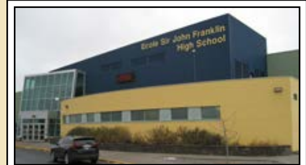
École Sir John Franklin High School (9-12) 4701 52 Avenue • X1A 2N8 (867) 669-0773 • sjf@yk1.nt.ca Website: www.yk1.nt.ca/sjf Facebook: @yk1sjf