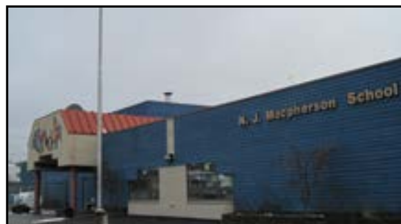
École N.J. Macpherson (prém. à 5) 525 rue Range Lake • X1A 3X1 (867) 873-4372 • njm@yk1.nt.ca Site internet: www.yk1.nt.ca/njm Facebook: @yk1njm