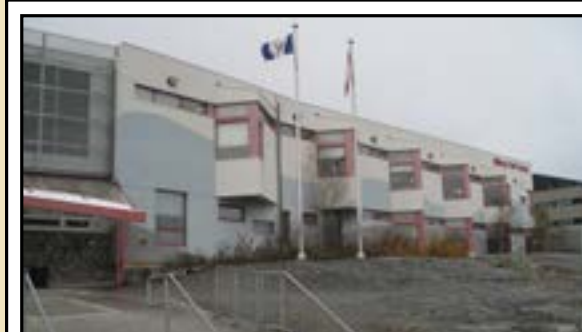
Mildred Hall School (JK-8) 5408 50 Avenue • X1A 1E5 (867) 873-5811 • mhs@yk1.nt.ca Website: www.yk1.nt.ca/mhs Facebook: @yk1mhs