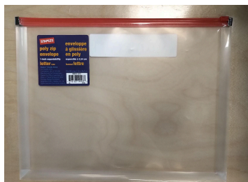
Poly zipper envelope (letter size)

★ As the year progresses, your child's teacher will let you know if any of these items need to be replenished.