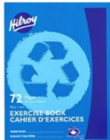
#12154 Unlined notebook (light blue)