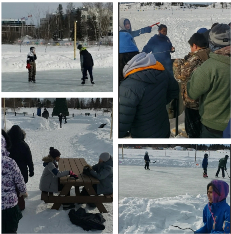
The Grade 7/8 Class had fun skating and roasting marshmallows over a fire before March Break!

With no Supersoccer this year, the Yellowknife Bay Soccer Club is having a Spring Kickoff soccer tournament in the first two weekends of May. Younger kids on the first weekend and older kids and adults on the second weekend. Anyone born in 2014 and older can participate.